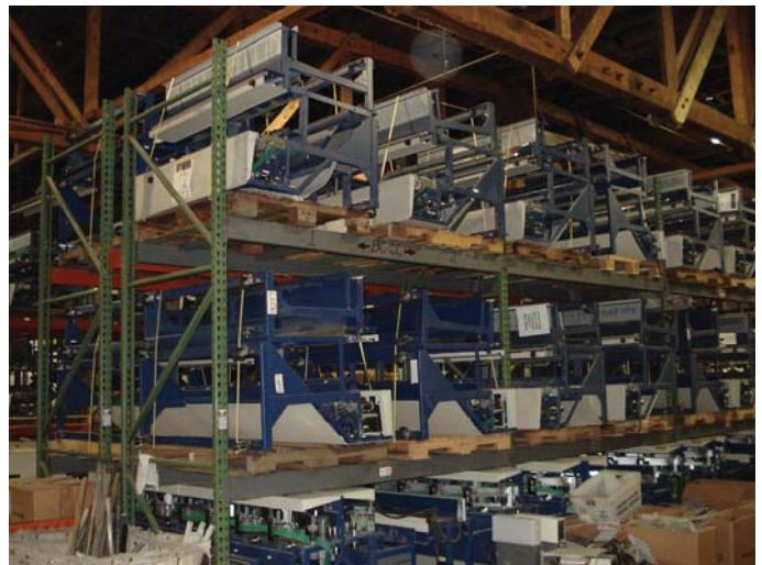
Figure 1: The original CSBCS machines are pictured in the warehouse.

Next, the mail is sorted with respect to whichever major hub is closest to its ultimate destination. It is then transported to that hub. In the not-so-distant past, the mail would eventually end up at some main local mail facility. Here, the mail would be fed into a Carrier Sequence Bar Code Sorter (CSBCS), which would read its barcode and sort the mail into the Carrier Route Sequence (see Figure 1). That is, the mail would be sorted based on the order in which it would be delivered by the carriers serving that community.