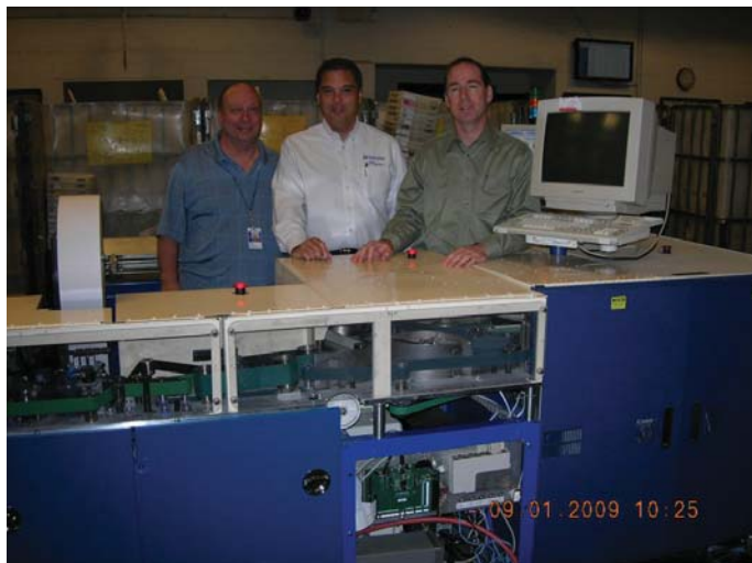
Figure 3: This picture shows the team standing in front of one of the retrofitted machines.

One really useful aspect of the Opal Kelly module is that it allows both data and control signals to pass into and out of the computer—all over a single twisted pair of USB wires. As Jerry points out, "We never even had to take the cover off of the computer." Opal Kelly also provides simple mechanisms to monitor and/or control signals, monitor and/or control events, and receive and/or output data.